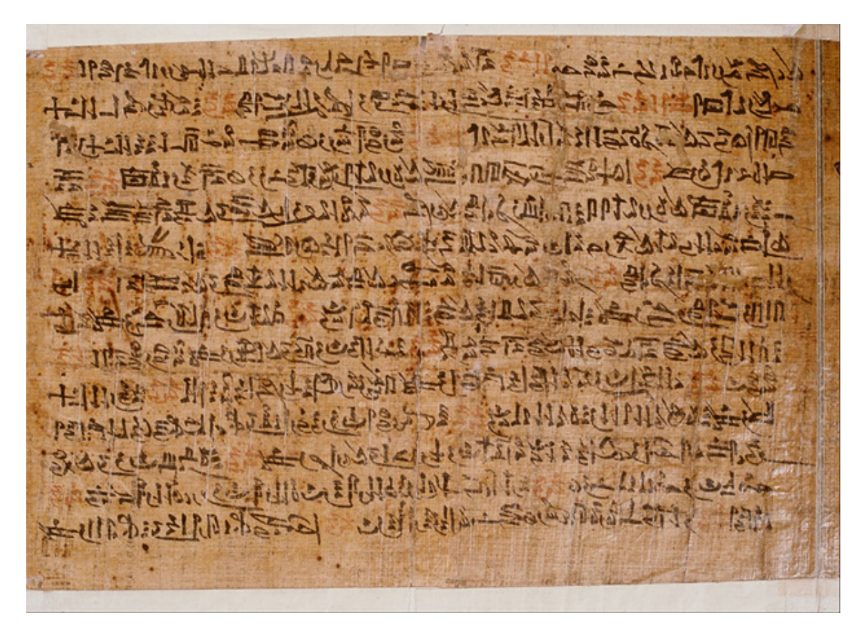
Figure 1. Photo of a section of the Ipuwer papyrus that is located in the Dutch National Museum of Antiquities in Leiden, Netherlands. (Public Domain)

There is one other factor to be considered. The pharaohs of Egypt had absolute power, and were ruthless in exercising it. Would Ipuwer have dared to say such things to the pharaoh as are written in this manuscript? This seems unlikely, because the pharaoh could